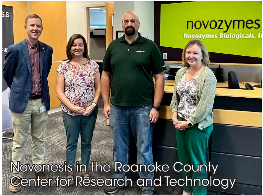
Novonesis in the Roanoke County Center for Research and Technology