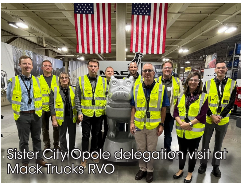
Sister City Opole delegation visit at Mack Trucks RVO