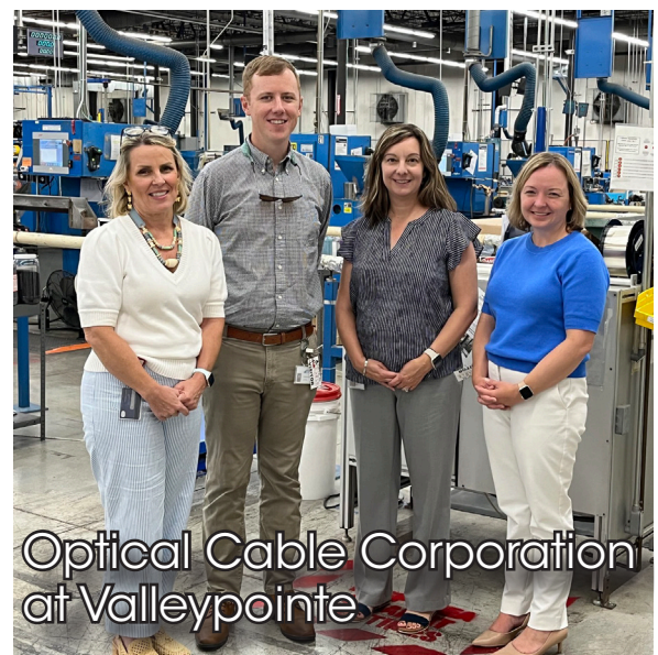
Optical Cable Corporation at Valleypointe