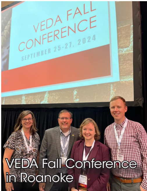
VEDA Fall Conference in Roanoke